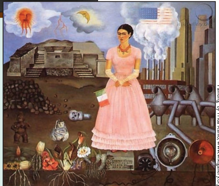
Painting by Frida Kahlo. www.wikigallery.org

During the five-year-long struggle, thousands of "No Scab Papers" signs sprouted on front lawns and in store windows around southeast Michigan in a massive show of community solidarity for the strike, which cost the two Detroit dailies nearly half of their circulation.