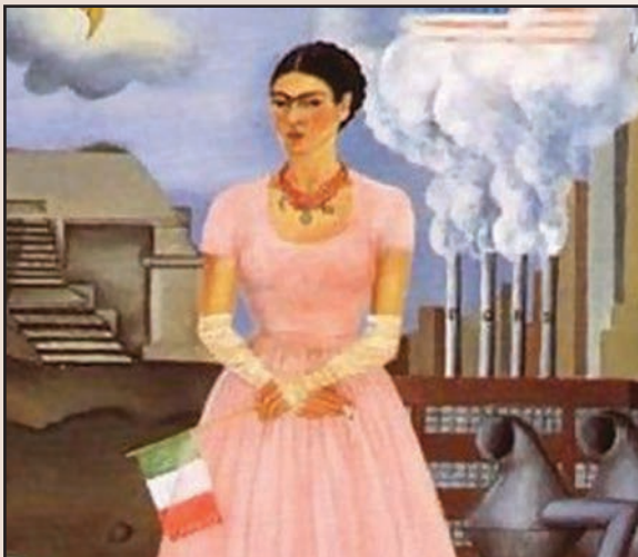
Painting by Frida Kahlo