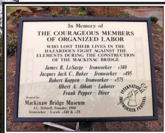
A plaque and statue commemorate the union workers who built the Mackinac Bridge, five of whom lost their lives.

Canada. Engraved bricks are embedded in the sidewalks adjacent to the monument area. To date, close to 200 bricks have been planted at the site and those names have been inducted into the "Ironworkers Walk of Fame."