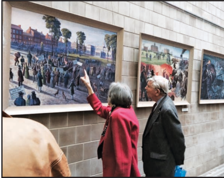
Visitors examine a display of labor history prints at the Walter P. Reuther library during a recent labor/Jewish history tour sponsored by the Jewish Historical Society. Labor history tours have been increasingly popular, with several tours recently sponsored by MLHS and a May Day Bernie's Brigade/Detroit Area Workers Now tour.

In May, about 20 delegates to the state convention of the National Association of Letter Carriers walked a two-mile route from their hotel to Grand Circus Park, where they learned about Mayor Hazen Pingree, the "idol of the people," and the 1891 streetcar strike and then south on Woodward Avenue to the former Woolworths five-and-dime store to hear about the 1937 sit-down strike by 108 young women workers. They also visited Cadillac Square and the Labor Legacy Landmark and Underground Railroad monument at Hart Plaza, before adjourning to the Anchor Bar for more discussion and socializing.