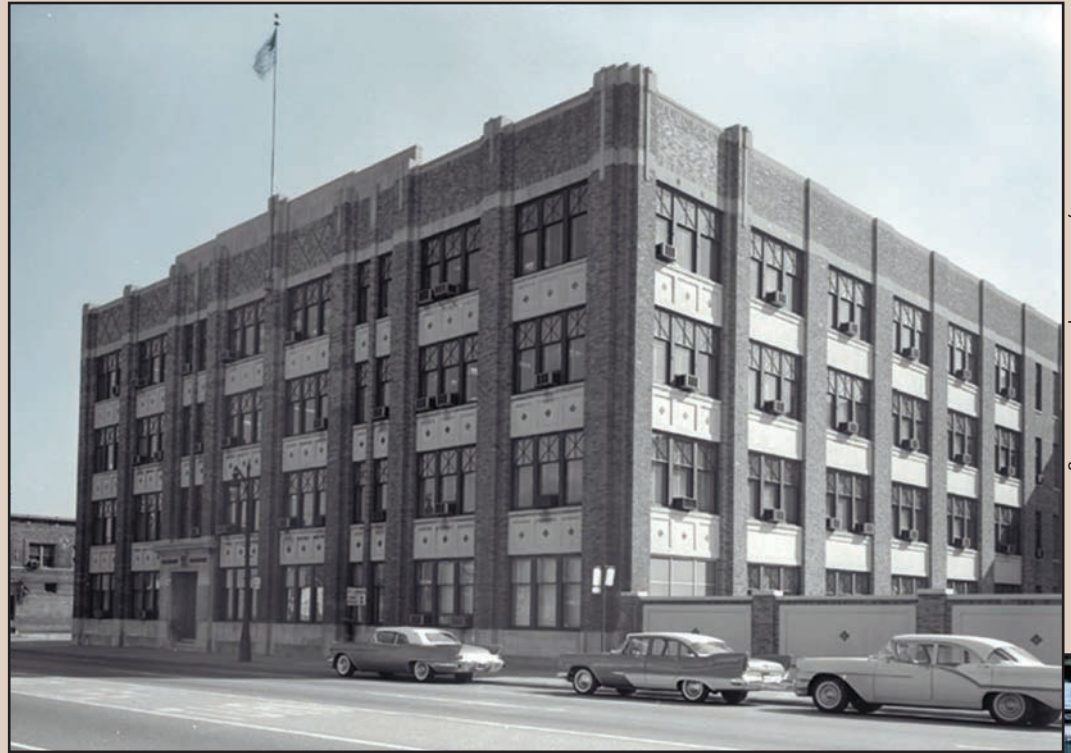
Factory and worker photos: GM Heritage Center

“I have found women very dependable, vocal, and militant,” Nowak said, “often more so than men.” Nowak led a union bargaining committee with a large group of women to meet with