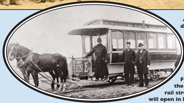
An early horse-drawn streetcar, and a group of Detroit streetcar workers around the turn of the 19th Century. Far left, building the new M-1 light-rail streetcar line that will open in Detroit in 2016.

Streetcar workers formed an Employees Association and began to fight back by pushing for a 10-hour day. The firing of 12 organizers in April of 1891 was the catalyst that provoked the strike.