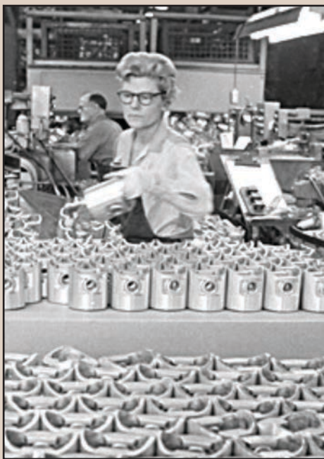
Left, opposite page, the old GM Ternstedt plant at Livernois and Fort in Detroit, since torn down; top, a UAW woman working at Ternstedt in 1942, five years after the union held its slowdown; below, a 1940 Chevrolet Special De Luxe KA Convertible Coupe likely had its chrome parts manufactured at the Ternstedt plant.